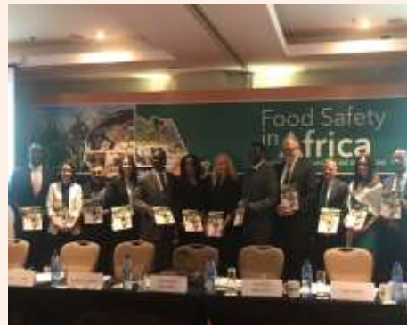
Two days of transforming knowledge into action in Addis Ababa Delegates at the launch of the report by Global Food Safety Partnership

The Food and Agriculture Organisation of the United Nations (FAO), the World Health Organisation (WHO), and the African Union (AU) organised the first international food safety conference , held in Ethiopia from 12 to 13 February. It brought together government ministers, policy-makers and representatives of non-state groups from all regions across the world to reflect on various food safety challenges with the aim of strengthening food safety systems. A follow-up event, the International Forum on Food Safety and Trade, will be hosted by the World Trade Organisation in Geneva on 23-24 April 2019.