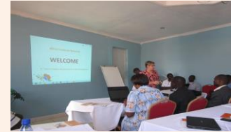
Networking event in Mchinji, Malawi

The UJ-BCURE programme in Malawi, in partnership with our implementing partner – Citizens' Health – focuses on supporting the Ministry of Local Government and Rural Development (MLGRD) in evidence-informed decision-making. In 2015 we are working in Mchinji and Ntchisi districts with the District Monitoring and Evaluation Coordinating Committees which comprise of M&E officers from various sectors. During a recent visit to Malawi members of the UJ-BCURE team participated in mentoring activities in both districts. Mentoring focused on the application of EIDM learning in specific sectors in cases that have been identified in partnership with Ministry. We were also able to attend a networking event in Mchinji that brought together government and non-government partners. The trip was very successful in promoting the AEN and we welcome all our new Malawi members to the network.